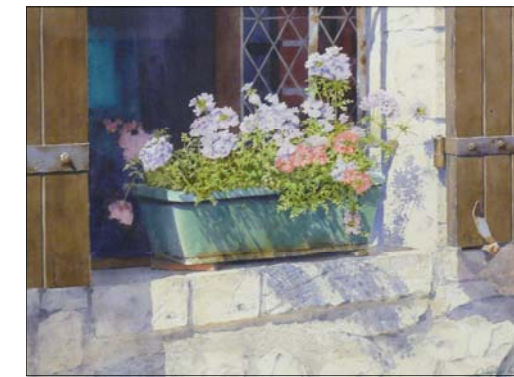
David Lee Kalish Finest Brushes Award